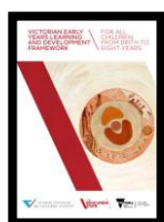
Victorian Early Years Learning and Development Framework

Approved learning framework: a guide which provides a vision for learning, pedagogical principles, practices and general goals or outcomes for children’s learning and how they might be attained. It provides a scaffold to assist educators to develop their own, more detailed curriculum relevant to their setting and the children and families attending. The Early Years Learning Framework V2 (Belonging, Being & Becoming) , the Victorian Early Years Learning and Development Framework and My Time, Our Place V2; Framework for School Age Care in Australia are approved learning frameworks for use in Victoria ( refer to Sources ).